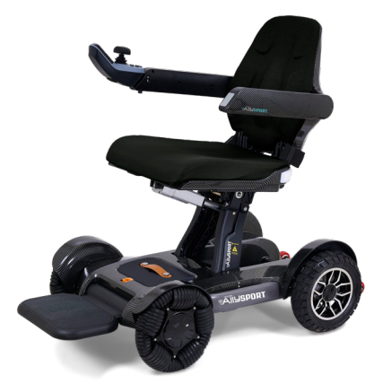
Shown in Black Carbon Fiber Pattern