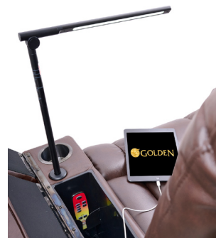
Removable LED Reading Light & Tray Table