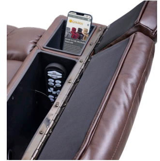
Wireless Smartphone Charger & Storage Compartment