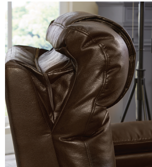
Adjustable Headrest & Lumbar