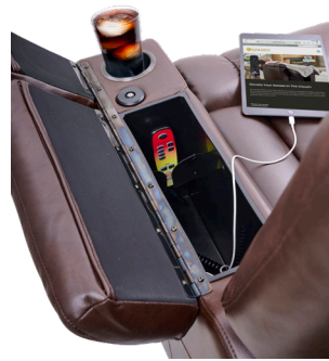
Cup Holder, Power Port, USB Charging Port & Storage Compartment